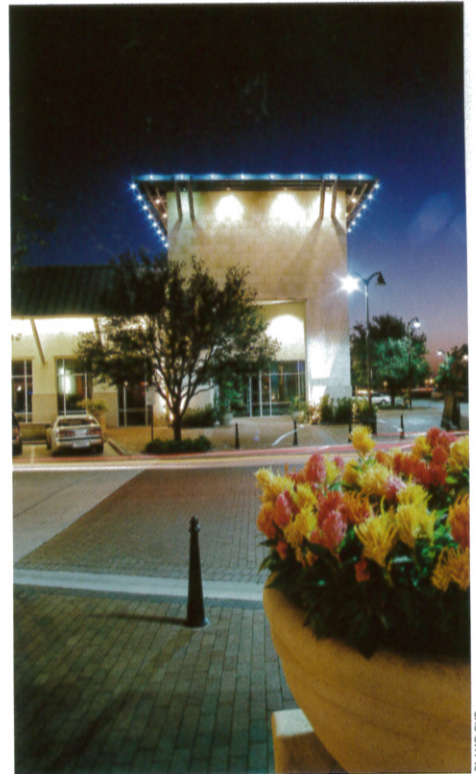
Shops at Legacy

Whether you crave the excitement of a big city or long for the wide open spaces, North Texas offers a variety of getaways, like these two towns that deserve a closer look.