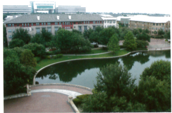
Park view from the Marriott Dallas/Plano at Legacy Town Centre

For over a century, Plano was primarily a farming community until it got caught up in Dallas' building boom. With all its growth, the city still has a charming historic downtown with an interesting Interurban Museum. An antique interurban car sits close to the tracks where the sleek DART train travels.