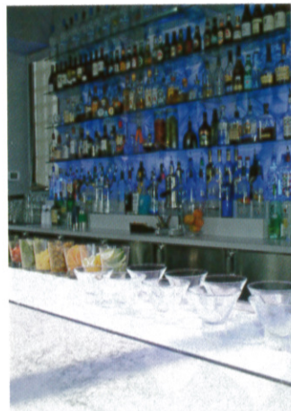
32° at Urban Crust in Plano features a 30-foot-long ice bar.

The settlement that became Plano began soon after Texas won its independence from Mexico with the 1841 Peters Colony. In 1848, the first doctor in the area suggested the name "Plano" for the community because he believed it to be the Spanish word for "plain." Let's hope his medical skills were better than his Spanish.