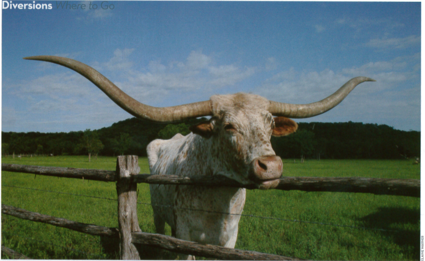
Big Boy, longhorn steer at Wildcatter Ranch, Graham