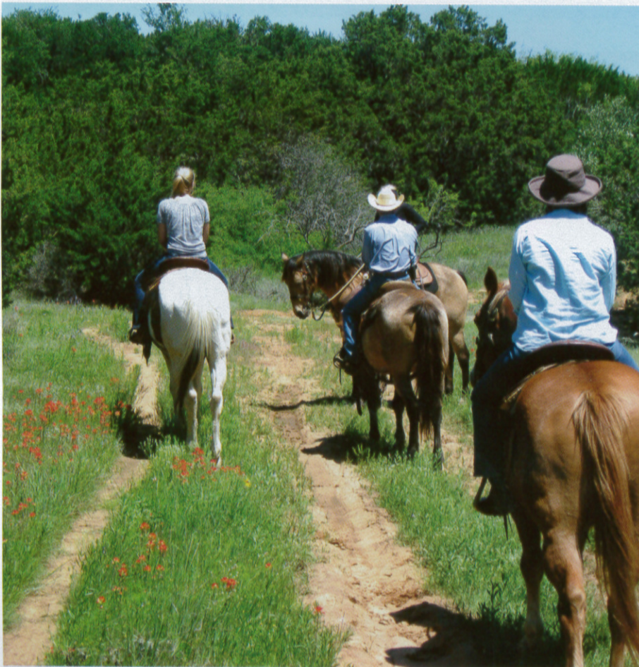
Horseback riding is a popular option at Wildcatter Ranch – trails go through meadows of wildflowers and up rocky hills for a view of the Brazos.

Finding accommodations in the area won't be a problem. Good choices include the Marriott at Legacy Town Centre, overlooking an attractive pond and park and just steps away from the shopping area. Two new and non-traditional hotels are Nylo and Aloft. Nylo is described as an "ultramodern boutique hotel with loft-style accommodations." That could describe Aloft, too – a hotel so hip that it even has a signature fragrance.