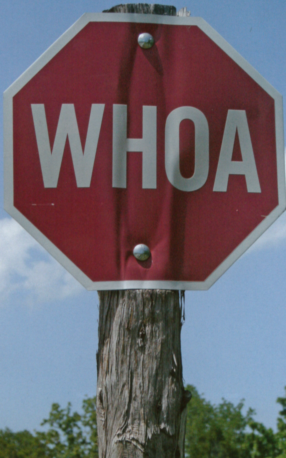
Wildcatter Ranch sign- that's STOP in Texan.