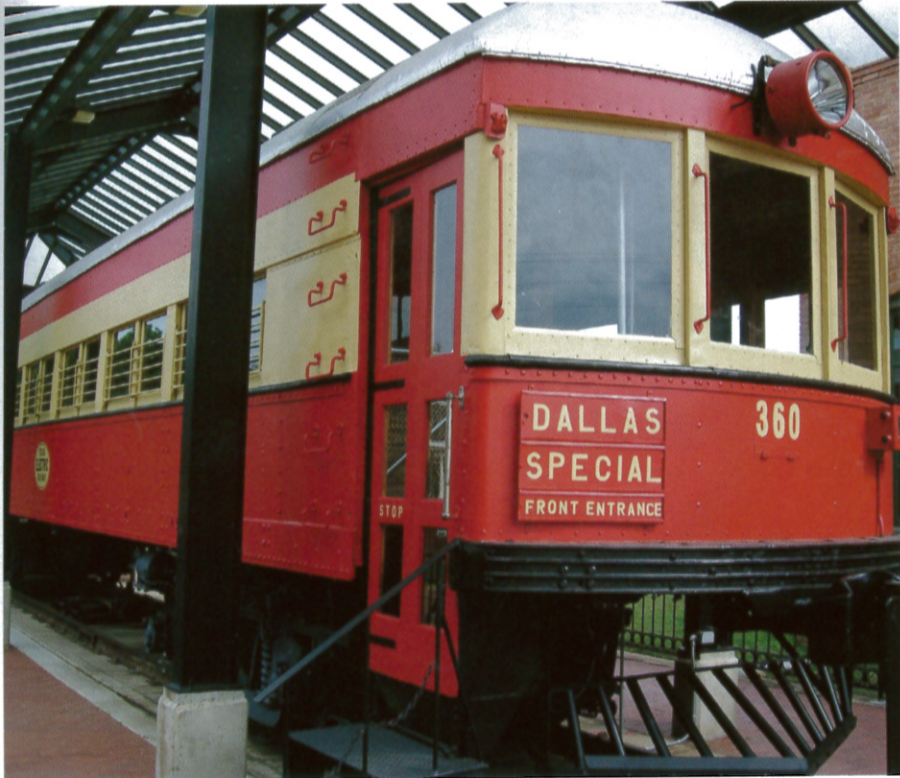
The Texas Electric Railway which operated from 1908 until 1948