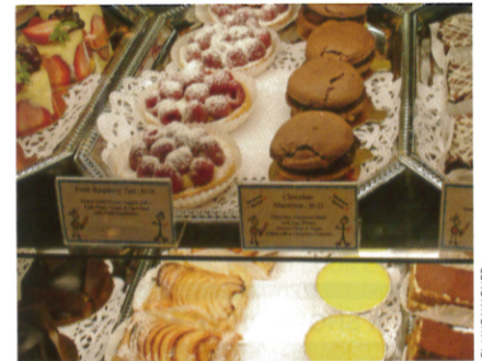
Pastries at Main Street Bakery

Other activities include horseback riding, hiking, biking, bird watching, fossil hunting, sand volleyball, basketball, tetherball, fishing, archery, shooting sporting clays and swimming. Or you can lounge in the hot tub, get a massage in the spa or just enjoy a rocking chair. There's a gift shop on the ranch, and in town you'll find some interesting shops and an upscale art gallery in an old church.